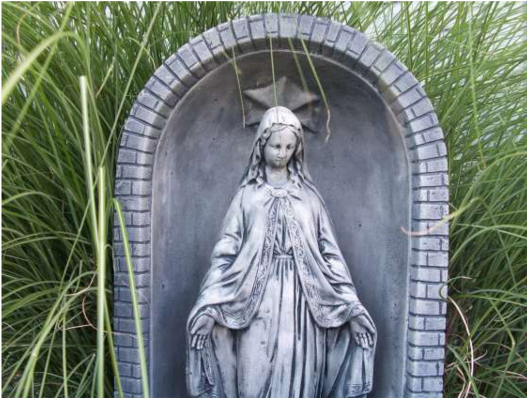
Our Lady Star of the Sea